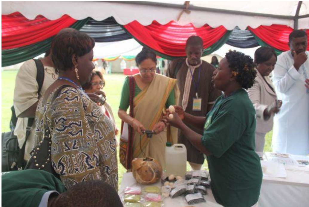
Kenyan farmer innovator discussing her innovation with visitors at the Eastern African Farmer Innovation Fair